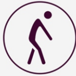
Sr. Citizen Park

Taking one step towards nature, we bring you the adorable landscapes, of the huge central lawns, that opens up the world of outdoor spaces to you. While the lush green area soothes your senses and calms your soul.